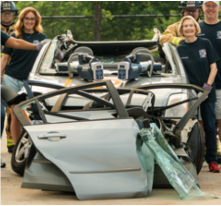
a completed car extraction