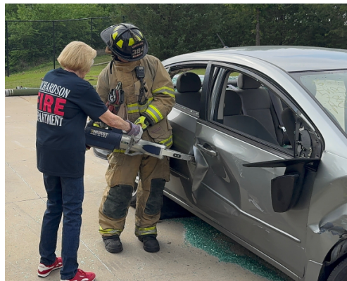
cutting off a door