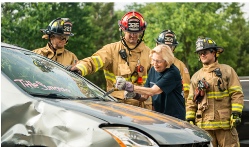
sawing a windshield

Working with these city leaders has given me valuable insights into my community and has been far more rewarding than I ever could have imagined. These experiences have far exceeded what I expected to be doing in my eighties – and I have enjoyed every minute!”