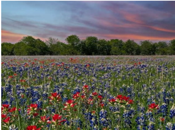
Bluebonnets in Austin, TX