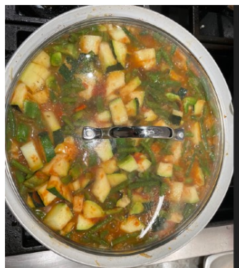
Sunshine yard long green bean recipe with squash, peppers, onion, garlic beans