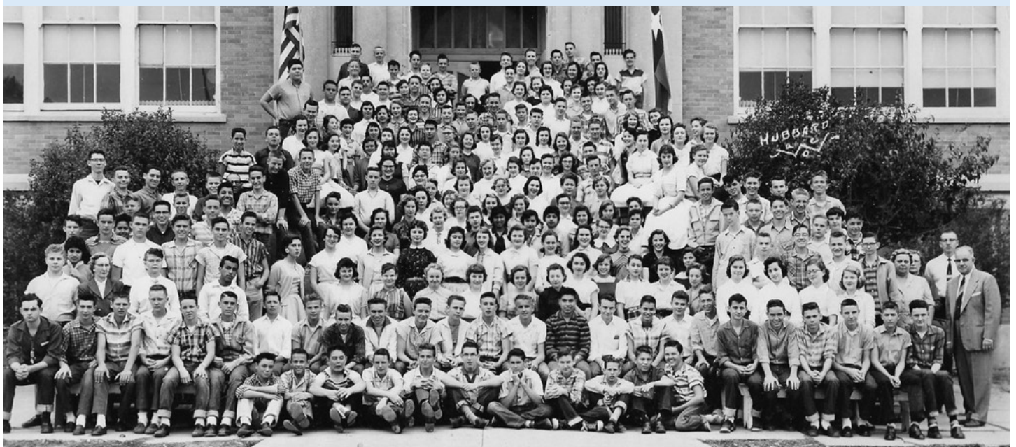
West Jr High 1957