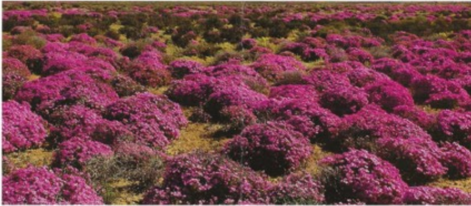
Wildflowers/Namaqualand – Western Cape

Back to the USA now - Spent 2 weeks in California then came to Boston. Now except for the pines, all the trees are bare- ruined choirs where late the sweet birds sang."