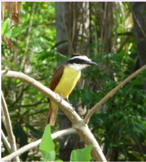
Great Kiskadee Flycatcher

I was able to capture some photos of many birds I'd never seen before. I thoroughly enjoyed the day. Here are a few of my photos.