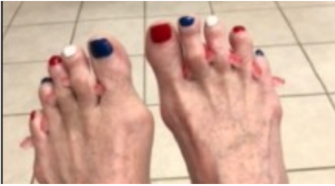
4 th of July nails

“Got these done last Saturday. The Vietnamese ladies love it when I appear.” (for Easter)