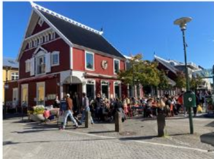
Ingolfur Square... a Reykjavik City Square