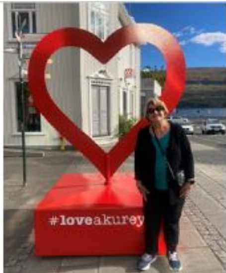
Akureyri, largest town outside Iceland's more populated SW corner. Nicknamed "Capital of North Iceland"