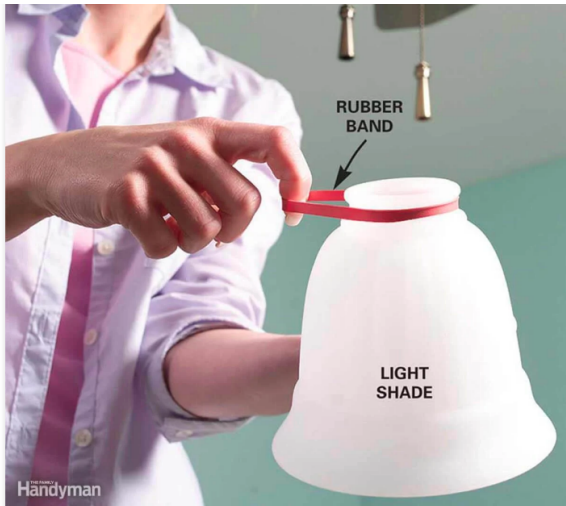
No-Rattle Ceiling Fan

If the screws that hold the light globe to your ceiling fan tend to work loose and then hum/rattle, slip a wide rubber band around the neck of the globe where the screws grip it. The rubber band prevents the screws from loosening and eliminates most of the noise.