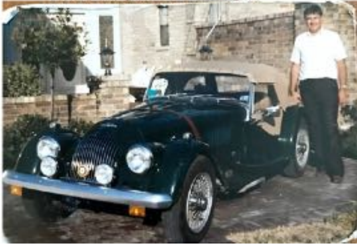
1985 New Morgan ordered from England