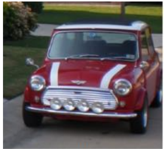
Classic red Mini Cooper