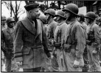
General Eisenhower inspecting the 29th Infantry Division in Cornwall. The Division landed on Omaha Beach on June 6, 1944.