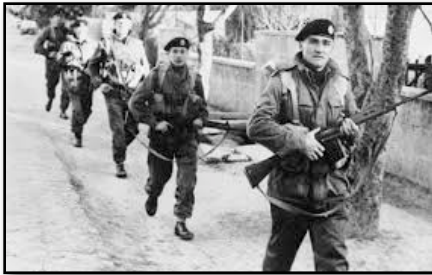
British Army units in Cyprus