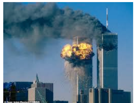
The south tower is struck at 9:03 a.m. on September 11, 2001.

entered the burning South Tower telling his staff he was returning to the Morgan Stanley offices to help evacuate the handicap employees. The South Tower collapsed at 9:56—just 53 minutes after it was hit. Rick and the bodies of the other 3,000 people who died on September 11, 2001 were never recovered.