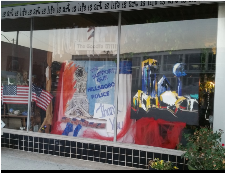
Window honoring Hillsboro policemen