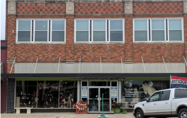
front of Bonnie's store

year. It was originally built to house a furniture store. The site has fulfilled her dream to live in a building. When Bonnie built the loft, there was neither water nor electricity on the third level--no walls—just a bare shell. Now, the completed loft is about 3400 sq.ft. The total third level is 6000 sq.ft, ground floor- the same, and the mezzanine is 3000 sq.ft. Below is a picture of her store and her store windows at Christmastime.